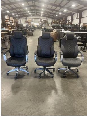
Bentley Hinged Arm Executive Desk Chair