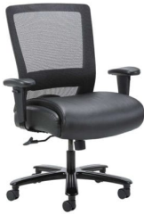
400# Rated Mesh Back Multi Function Desk Chair