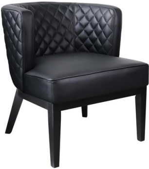
Bentley Guest Lobby Chair