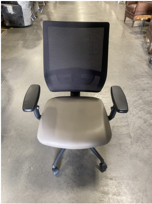
Lacasse United Desk Chair