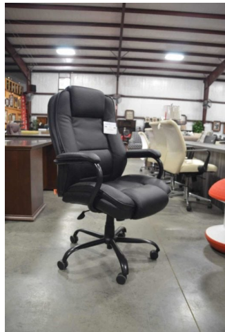
Executive Desk Chair